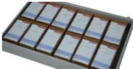
Capacity of 12 bins per drawer. (Bins not included)